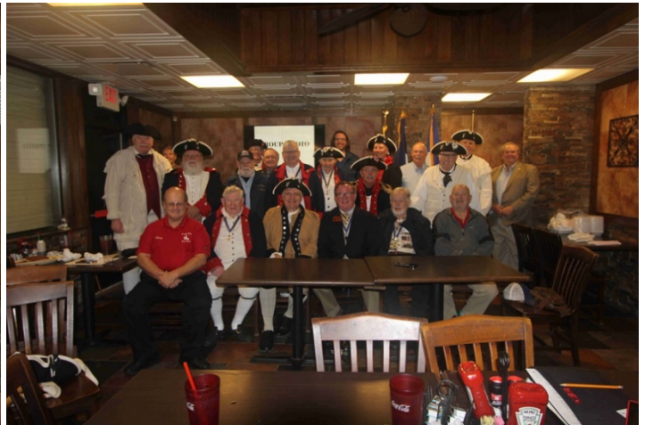
December Chapter Meeting