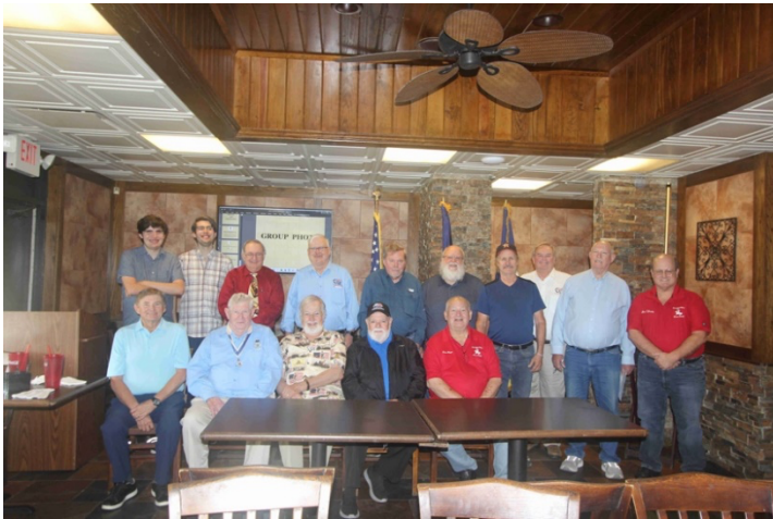
November Chapter Meeting