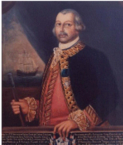
Bernardo de Gálvez