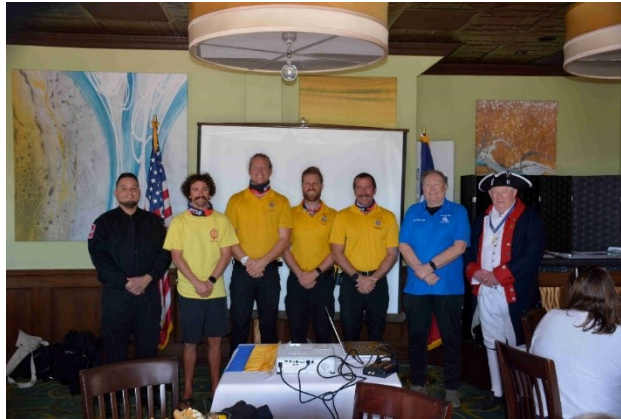
First Responders Awards