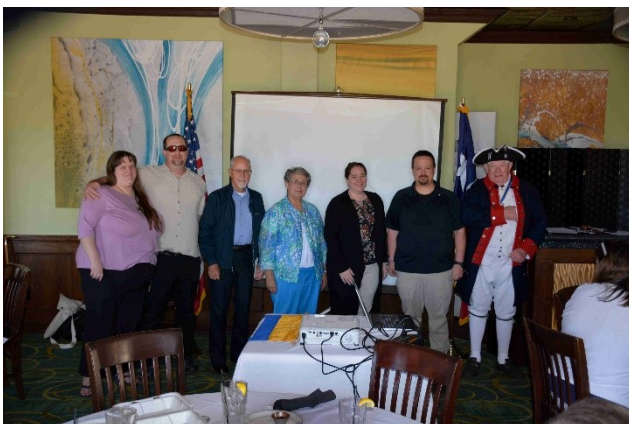
New Members Sworn In

Since April of this year, COVID19 and its mutations Delta and Omicron have continued to have a serious impact on our nation as well as other countries. However, with the vaccines that are now available, many of us have resumed a somewhat normal life. We have continued to use ZOOM as a resource for speakers from outside our immediate area for our monthly meetings and for conducting Executive Board Meeting. In July the monthly chapter meetings were moved from Landry's in Galveston to Kelley's in La Marque. The reason for the move was two-fold. First, there was no access to ZOOM at Landry's, and there was at Kelley's. Secondly, since most of the chapter members live on the mainland, it was hoped that more members would attend the meetings if was held in a more central location with less traffic congestion. This newsletter will cover the period from 1 May to 31 December of this year.