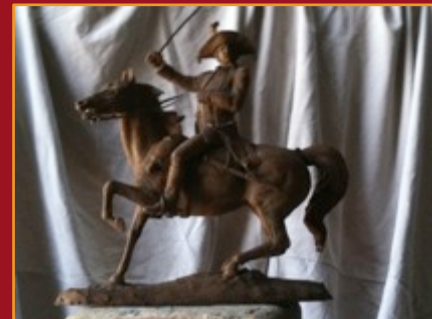
Miniature of the Gálvez statue.

For more information, please visit http://galvezstatue.org .