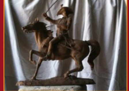
Miniature of the Gálvez statue.

For more information, please visit http://galvezstatue.org .