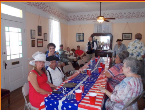
Members of the Bernardo de Gálvez Chapter #1, TXSSAR celebrate Independence Day with their families in Galveston.