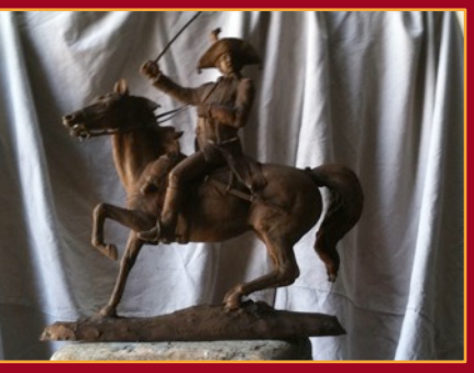
Miniature of the Gálvez statue.

For more information, please visit http://galvezstatue.org.