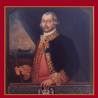
Bernardo de Gálvez

MARCH 27 – MARCH 30 TXSSAR Spring Convention